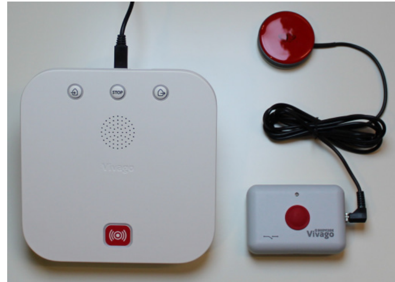
Figure 4. Domi POINT care phone, device interface and touch switch

A Device Interface can be used to connect additional alarm pedants, door monitoring or a nurse present device for the secondary watch. The Appendix 2 contains a list of device interfaces for the Vivago DOMI care phone.