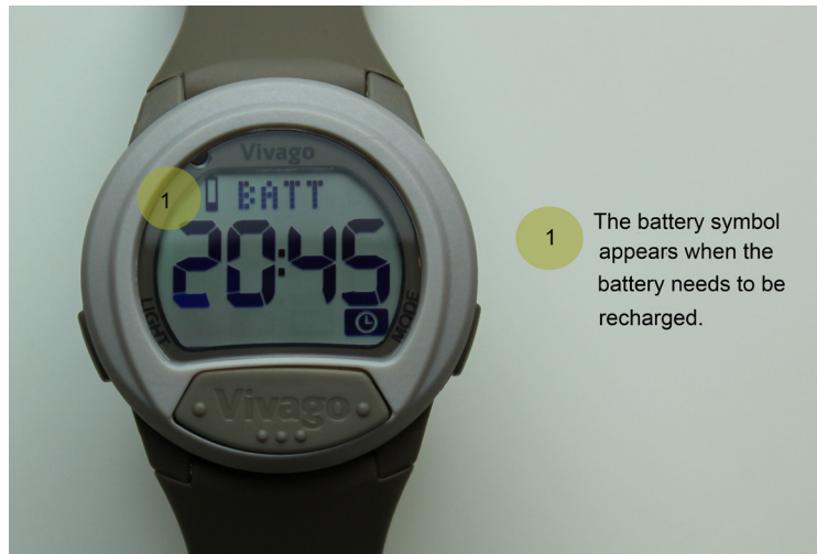
Figure 5a Vivago CARE watch indicates with the battery symbol when the battery is nearly empty