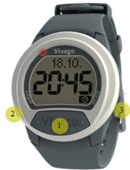
Figure 1b. The Vivago CARE watch