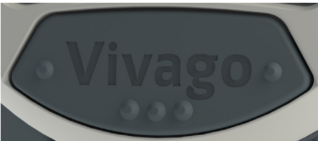
Figure 1a. Vivago-button

The manual alarm can be triggered even if the Vivago CARE watch is not on the wrist. It is also possible to trigger the alarm using the alarm button on the Domi POINT care phone, see figure 2, or any additional buttons that are connected to it.