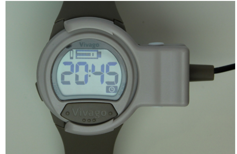
Figure 5b Vivago CARE watch connected to the charger