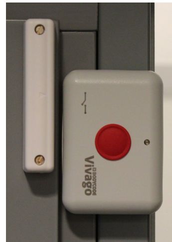
Figure 4b. Device interface used for door monitoring